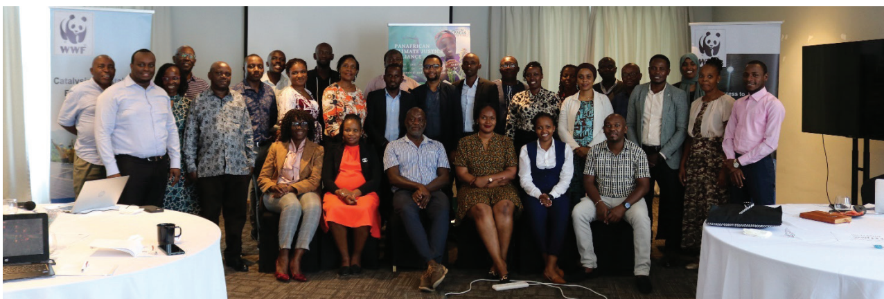
Harmonization of the East African Common Customs Management Act in Renewable Energy, Dar-esalam Tanzania

PACJA convened meetings that invigorated civil society and African Energy Commission relationship through proactive engagement. The meetings focused on deepening reflections on energy issues, resolve existing conceptual tensions, elucidate African perspectives, and develop strategies for CSO engagement in shaping policy and practice for a just and democratic energy transition in Africa. Some of the meetings conducted in the period under review include: Further PACJA trained 16 CSOs on policy advocacy and influence guided by an advocacy policy document prepared earlier. A total of 16 CSO representatives from EAC and SADC member countries were trained on the continued use of the Advocacy Strategy in influencing development and review, monitoring of initiatives, learning and sharing and making use of key moments to increase awareness on the advantages of renewable energy. A synopsis document that serves to help the CSOs understand the policy and legislative environment with respect to energy access and the necessary inclusions and alignments in NDCs to anchor the renewable energy sector initiatives was shared to support CSOs in influencing the implementation of NDCs. The trained CSOs are expected to develop and implement targeted education and awareness campaigns that inform citizens of the benefits of renewable energy, its role in addressing climate change and how it contributed to environmental human rights.