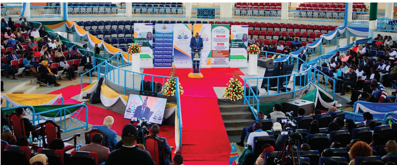
Ezekiel Machogu, EGH - Cabinet Secretary for education giving his opening remarks during the Opening High Level Symposium for the NSCCJ 3

The third Nairobi Summer School on Climate Justice was held between 4 th – 15 th July, 2023 at Kenyatta University. The school saw over 300 participants attending physically while over 200 others attended virtually. The participants were drawn from 73 African countries. Out of the 73, 51 countries were from Africa. The school commenced with a high-level symposium graced by distinguished individuals and organizations such as The Ministry of Education (Kenya), Kenyatta University, The National Assembly in Kenya, The Danish High Commission, SIDA, AfDB, AU, UNECA, The World Bank, AGN, PACJA and Alumni of the Nairobi Summer School on Climate Justice.