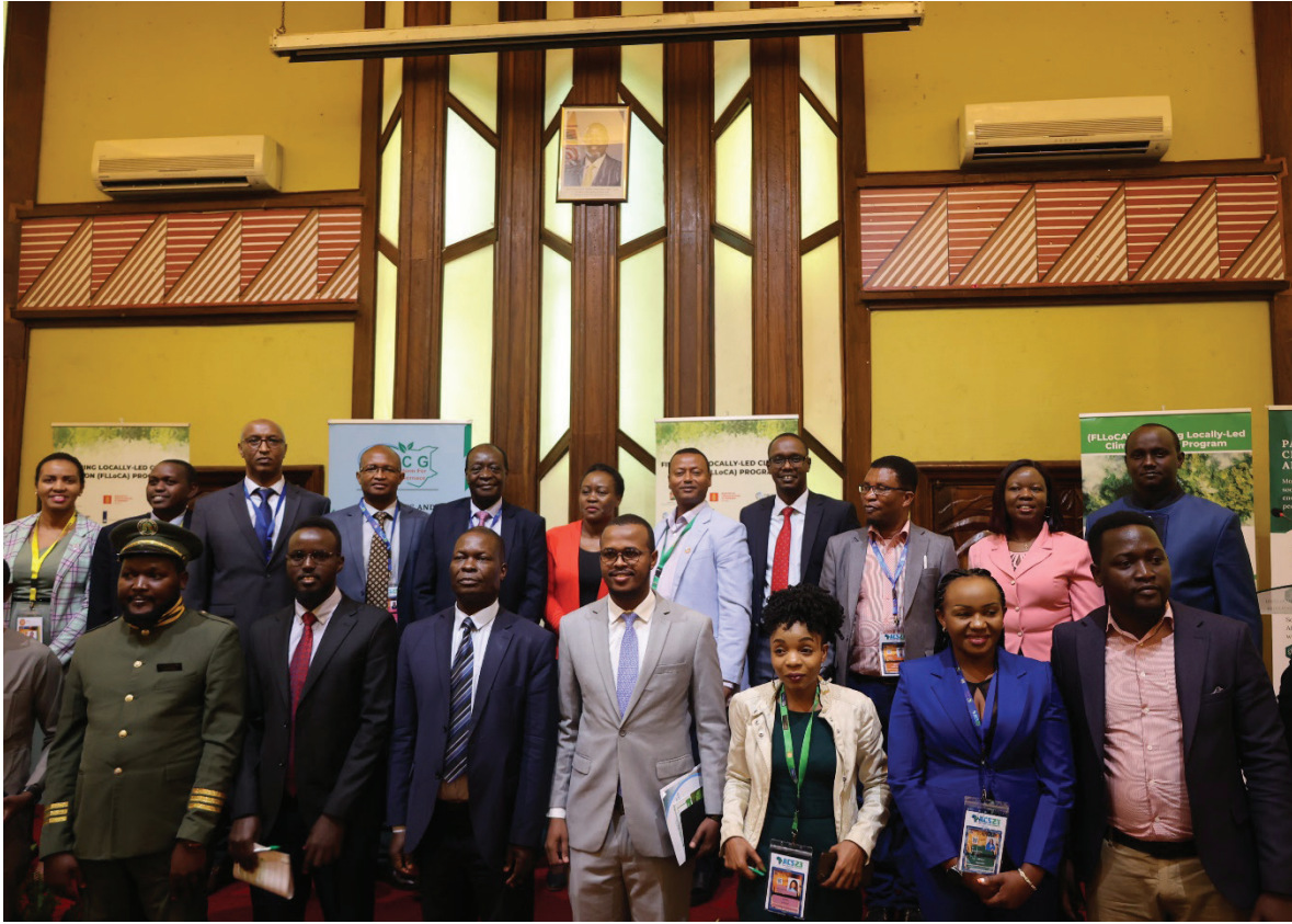
Group Photo of high-level participants at the National Conference on Financing Locally-led Climate Action Held at Safari Park Hotel

In addition, PACJA through the Kenya Platform on Climate Governance participated in stakeholder dialogue processes on the nexus between locally-led climate action, sustainable development and people-centered bottom-up approaches to NDCs implementation. The platform worked with the foreign missions in Kenya including the Dutch, Swedish, Danish embassies in hosting thematic dialogues in the build-up to the Africa Climate Summit. These dialogues focused on the role of Youth, women, indigenous people, private sector and civil societies in catalyzing locally led climate action in Kenya and beyond. During the period under review, two dialogue sessions were hosted by the Dutch and Danish embassies, while the final in the series ahead of ACS was hosted by the Swedish Embassy in Nairobi.