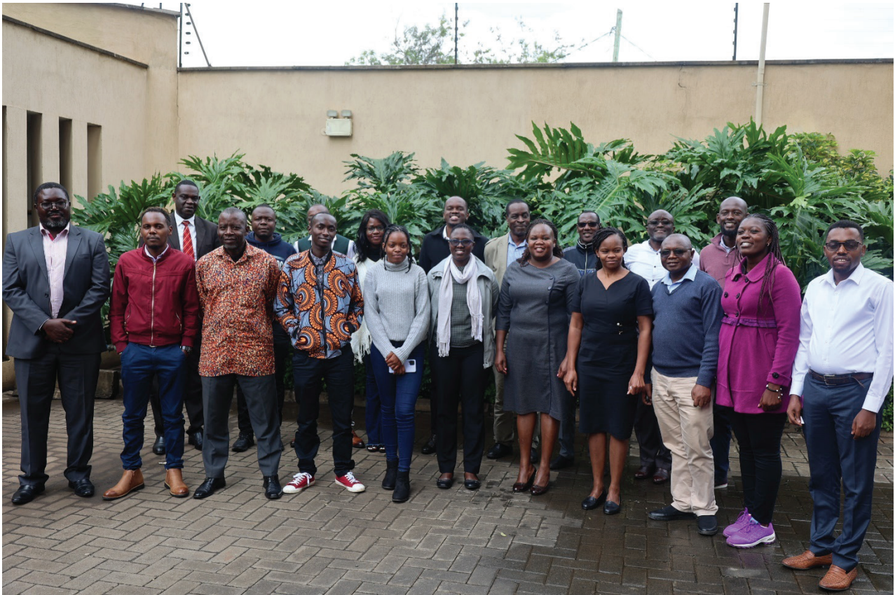
CJRFA K10 Inception Meeting held in Nairobi Kenya

Cohort 2, consisting of 10 projects, was commissioned in June 2023 with about EUR 85,000 investment from the CJRFA. In November 2023, Cohort 3 was onboarded onto the CJRFA platform after 15 successful projects from across the 8 AACJ countries (Burkina Faso, Ethiopia, Kenya, Mozambique, Nigeria, Senegal, Somalia, and South Africa) were identified from a large pool that responded to the April 2023 Call-for-Proposals. A maximum CJRFA investment of EUR 225,000 has been set aside for this Cohort. These projects are expected to wind down by February 2024 at a learning forum to be convened in Nairobi.