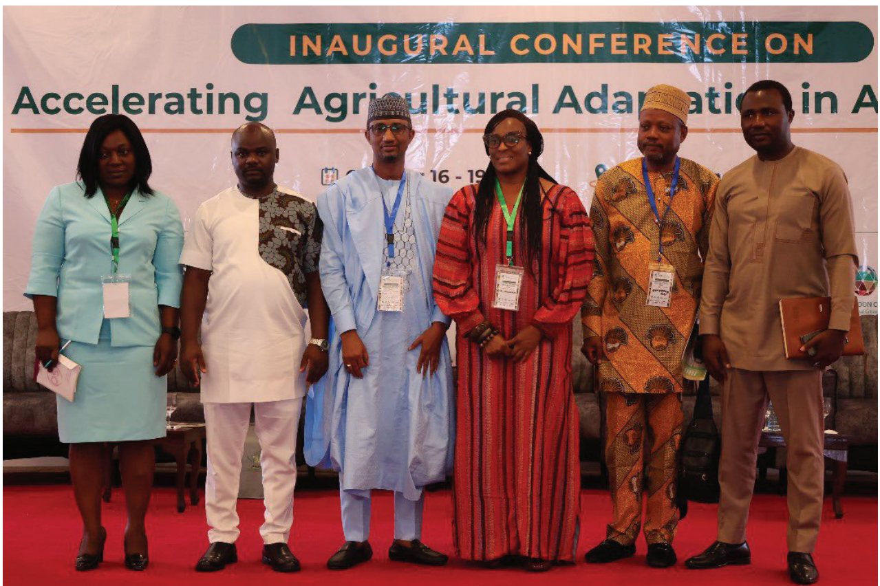
Climate Change and Health Panel at the C4A Conference in Abuja, Nigeria October 2023

On World Environment Day 2023, commemorated under the theme Beat Plastic Pollution, PACJA Cameroon chapter organized a multi stake holder meeting for people centered bottom-up approaches to NDC Implementation by Environmental Management Committees under Cameroon Climate Change Working Group (3CWG). At the end of the meeting, participants carried out a 1-day water catchment cleaning activity in 5 communities (Nkambe, Ndu, Nwangri, Sop and Taku). The main goal of the activity was to raise awareness on the dangers of plastic waste pollution on the environment, especially water sources, enhance ecological health, improve public health and discuss best practices of implementing the NDCs. The outcomes of the activity were: Improved water quality and sanitation of the communities, improved community health and increased awareness and engagement on NDCs.