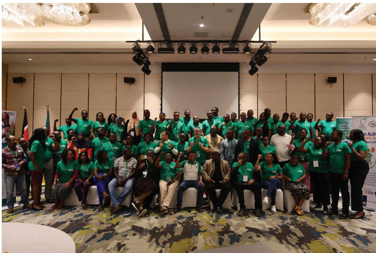
PACJA Staff and Dnp Retreat Addis Ababa Ethiopia

PACJA revised its theory of change to go beyond raising awareness of communities to facilitating enabling environments in which the people experience sustainable economic and social development which will then create a demand for policy change and government action on climate-resilience, transition to low-carbon pathways, green growth and environmental justice. Based on the strategic plan, PACJA developed its 10-year organisational strategic framework which tracks and records annual milestones achieved within this period. The organisation derives its areas of intervention from the organisational strategic plan 2021 -2025. Implementation of strategic plans is driven by yearly work packages which need regular review to ensure that the organisation is on track in achieving its strategic objective. In this regard, PACJA organised a staff, DNPs and board retreat in Addis Ababa at the side lines of the Africa Union summit. The retreat provided an opportunity for the entire PACJA team to reflect on the work done in 2022 and plan for 2023. The teams got an opportunity to review the achievements made in the year 2022, reflect on areas of improvement and develop their respective project-based/Strategic initiatives annual work plans and align them to the organisational results framework as envisioned in the strategic framework 2021 – 2030.