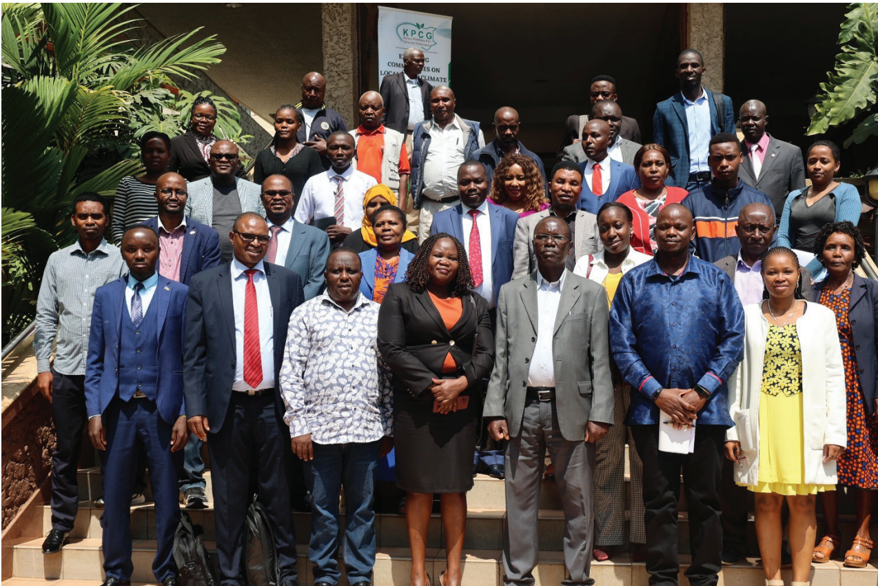
Consultative Forum on the Climate Change Amendment Bill in Nairobi, Kenya (Kenya Platform for Climate Governance Convened)

In this reporting period, PACJA enhanced its collaboration with water Aid and other partners in raising the profile of water as a critical agenda item in adaptation conversation. It is important to note that water scarcity and quality are significant global issues that need to be addresses to achieve sustainable development goals. Many countries face water related challenges including access to safe drinking water, water pollution and scarcity due to climate change. Water issues are often interconnected with environmental concerns such as biodiversity loss, deforestation and air pollution. PACJA collaborated with Water Aid in hosting a workshop on scalable climate resilient WASH innovative solutions and influencing their integration into the government and donor programming to meet WASH needs in dry seasons. The workshop was hosted in Nairobi in February and one of the outcomes of the meeting was consolidation of recommendations which formed the basis of engagements in the UN water conference which was held in New York later in March where PACJA co-hosted side events with Water Aid and the World Bank.