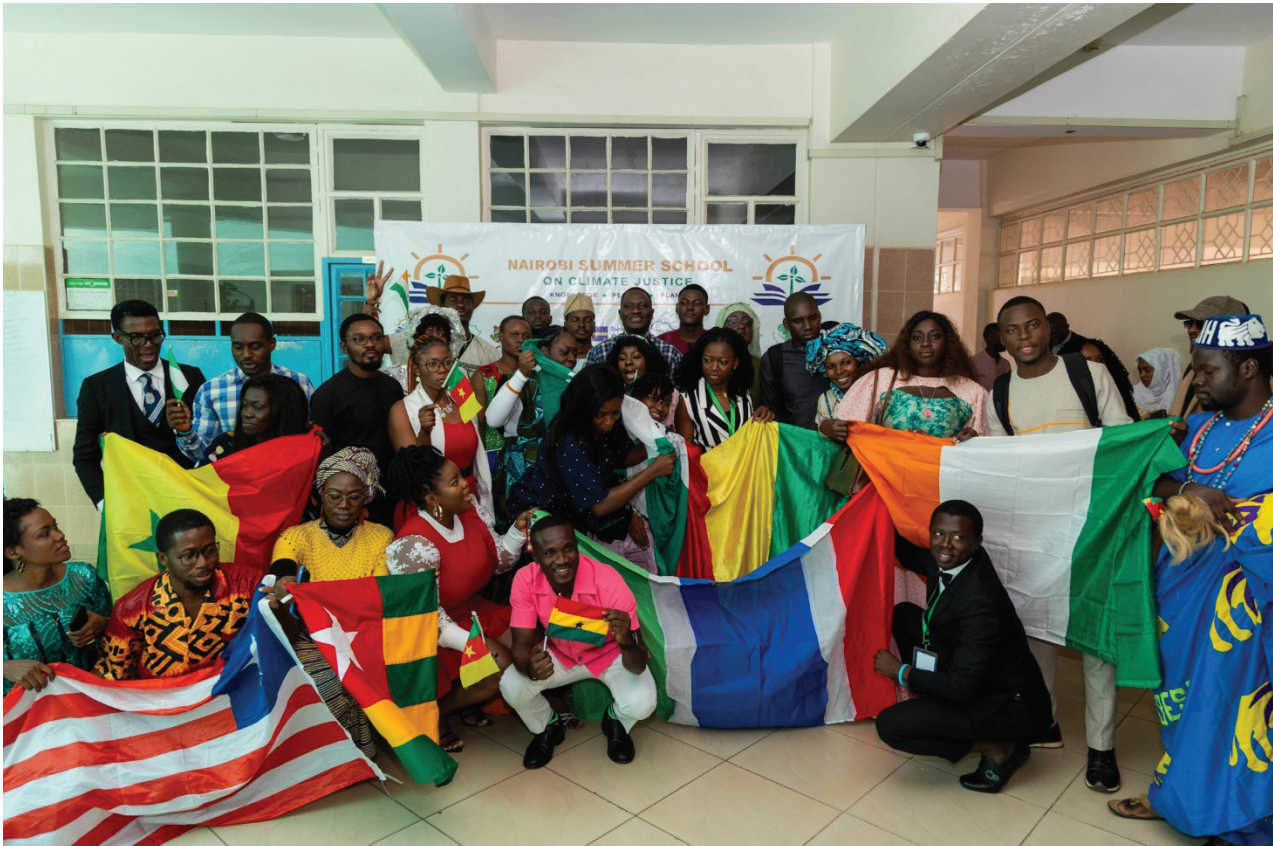
NSSCJ 3 Participants group photo session at the Closing Ceremony

PACJA conducted experts' strategy meeting in Cape town, South Africa in January 2023. The strategy meeting brought together a meticulously selected small team of thought leaders to deeply interrogate and reflect on the Cohort I and II, draw lessons and render ideas on how to deliver a more impactful Cohort III of the School. The participants included experts on climate justice, Curriculum Development, Research & Policy Analysis, Climate Science, International negotiations, Scholars and (frontline) Community activists. The strategy meeting resulted in reviewed curriculum for the summer school which is responsive to needs of the targeted participants. In this strategy meeting it was deemed necessary to develop targeted, tailor-made modules, putting into consideration the rapidly-shifting discourses in the international climate change dialogue processes, which oftentimes render concepts and ideas earlier thought to be solutions, obsolete. A road map on future inclusion of the summer school in the education curriculum through the ministry of education was also discussed