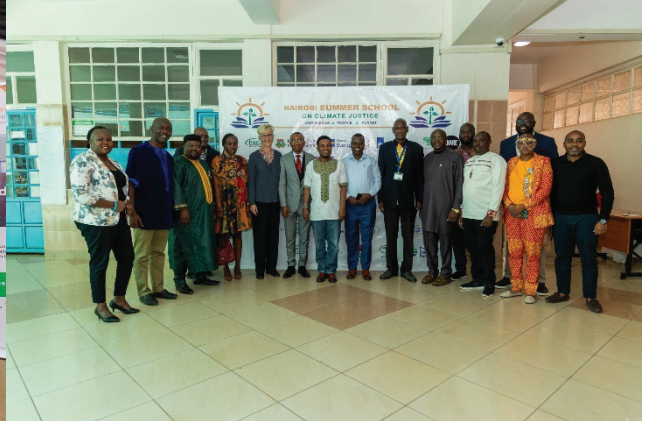
Cohort III of the Nairobi Summer School on Climate Justice

The third Nairobi Summer School on Climate Justice was held between 4 th – 15 th July, 2023 at Kenyatta University. The school saw over 300 participants attending physically while over 200 others attended virtually. The participants were drawn from 73 African countries. Out of the 73, 51 countries were from Africa. The school commenced with a high-level symposium graced by distinguished individuals and organizations such as The Ministry of Education (Kenya), Kenyatta University, The National Assembly in Kenya, The Danish High Commission, SIDA, AfDB, AU, UNECA, The World Bank, AGN, PACJA and Alumni of the Nairobi Summer School on Climate Justice.