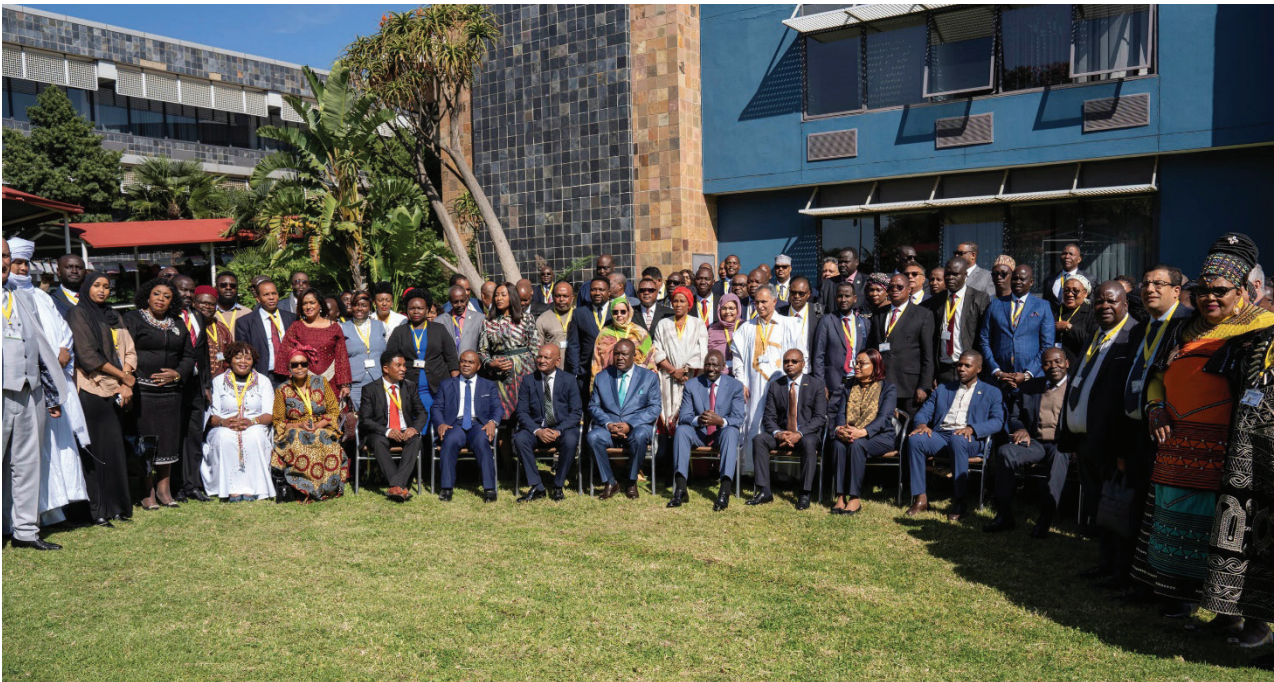
Group Photo of the Participants at the 3rd Pan-African Parliament on Climate Policy and Equity Midrand, South Africa