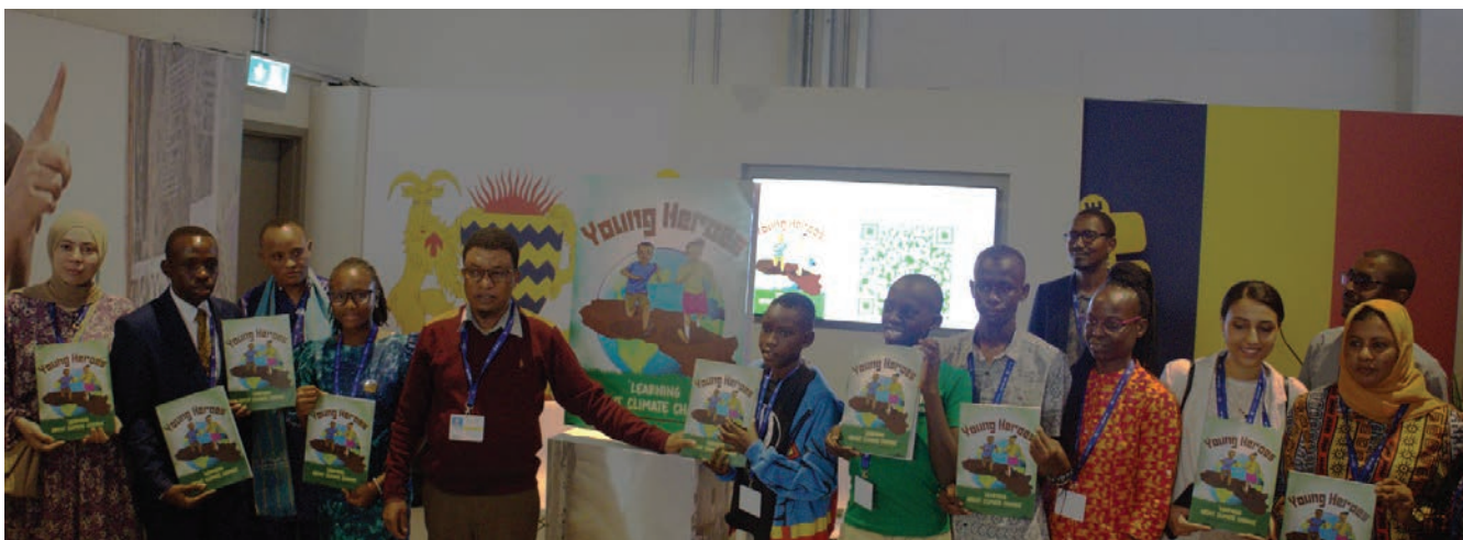
Launch of Children's Book on Children's rights and Climate Change at COP28

out of 49 African Countries assessed were found to be at high or extremely high risk of impacts of Climate change based on their exposure and vulnerability to cyclones, heat waves and other climate and environmental shocks, and access to essential services. These shocking figures underpins the urgent need to raise the profile of nexus between climate change and children rights. Accordingly, Pan African Climate Justice Alliance in partnership with Save the Children launched an educational children's book containing simplified content on climate change. Click here to download the book