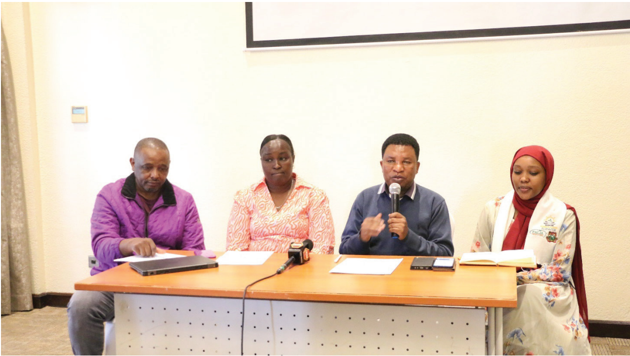
Non-State Actors Redline Statement in Nairobi, Kenya