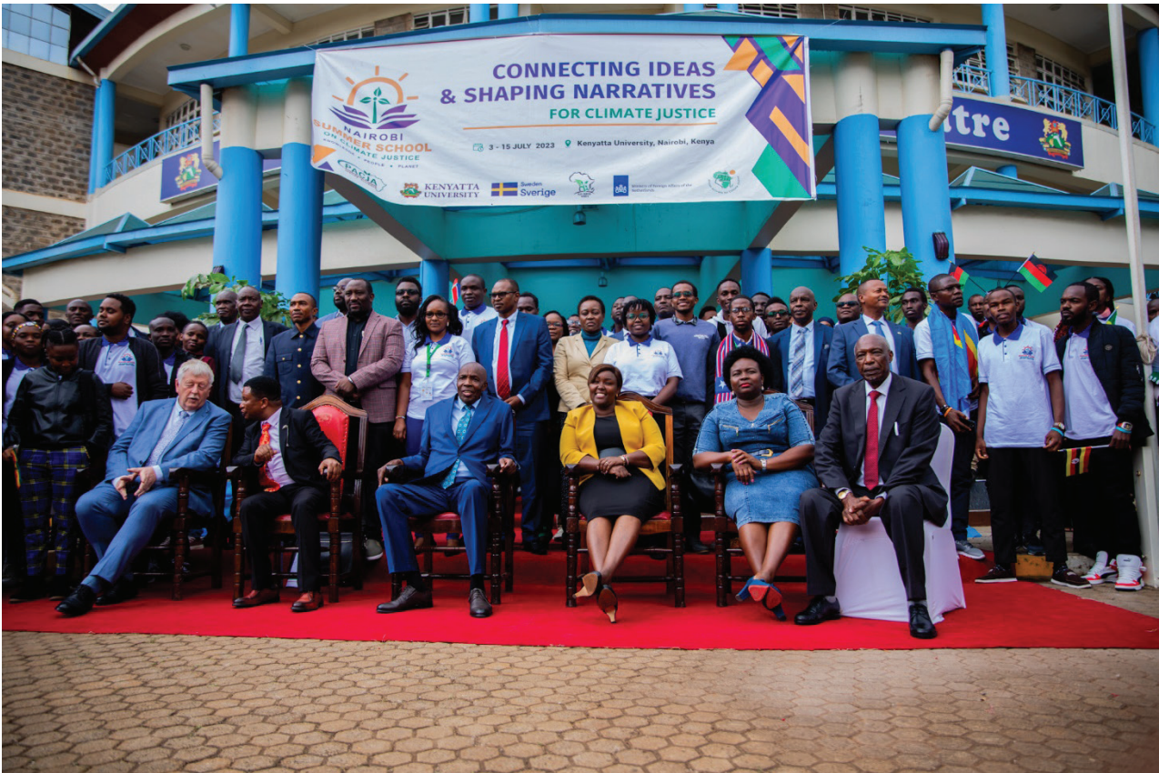
Opening High level Symposium of the Nairobi Summer School on Climate Justice