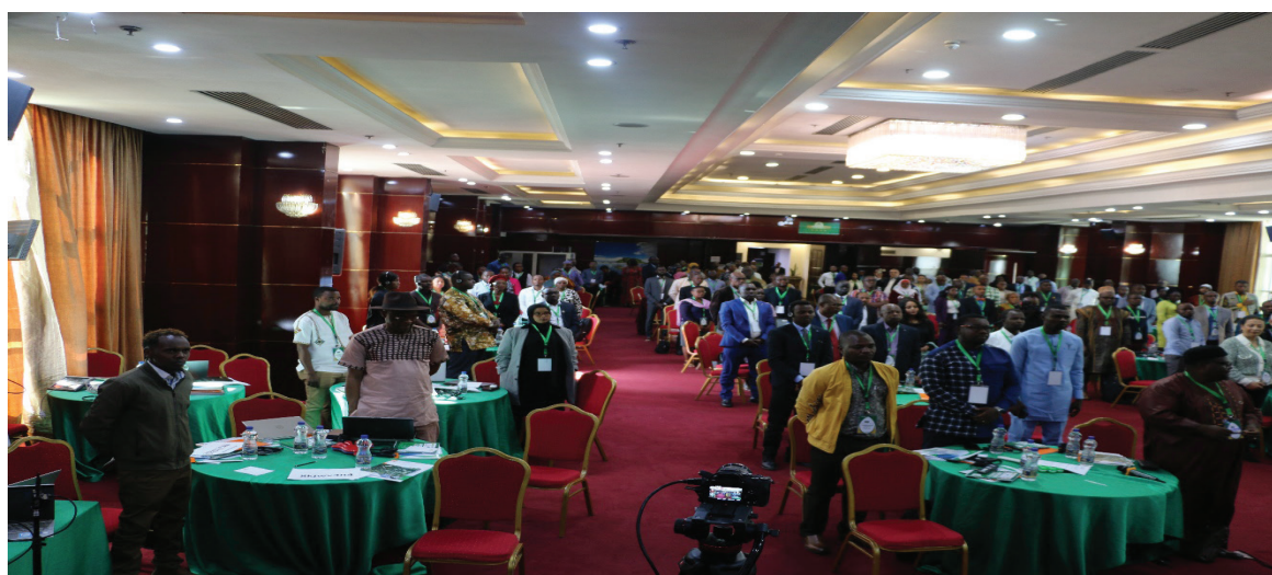
Participants at the General Congress, Addis Ababa Ethiopia