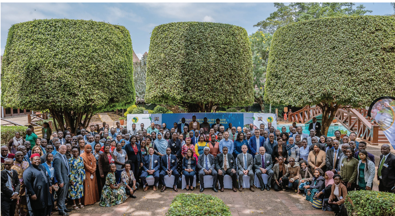
CCDA-XI Group Photo of Participants at Safari Park Hotel

It is because of the collective organising under ACS-NSA that prominent personalities like John Kerry, USA Special Envoy on Climate Change held a strategic dialogue session with representatives of civil society to discuss critical issues for the Africa Climate Summit. The footprint of the Committee were visible in the Eleventh Conference on Climate Change and Development in Africa (CCDA-XI), the flagship forum of ClimDev-Africa Initiative, which was held as a parallel technical segment of the Summit.