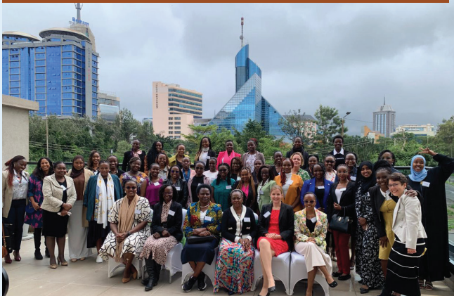
GIZ Hydrogen Meeting Nairobi Kenya