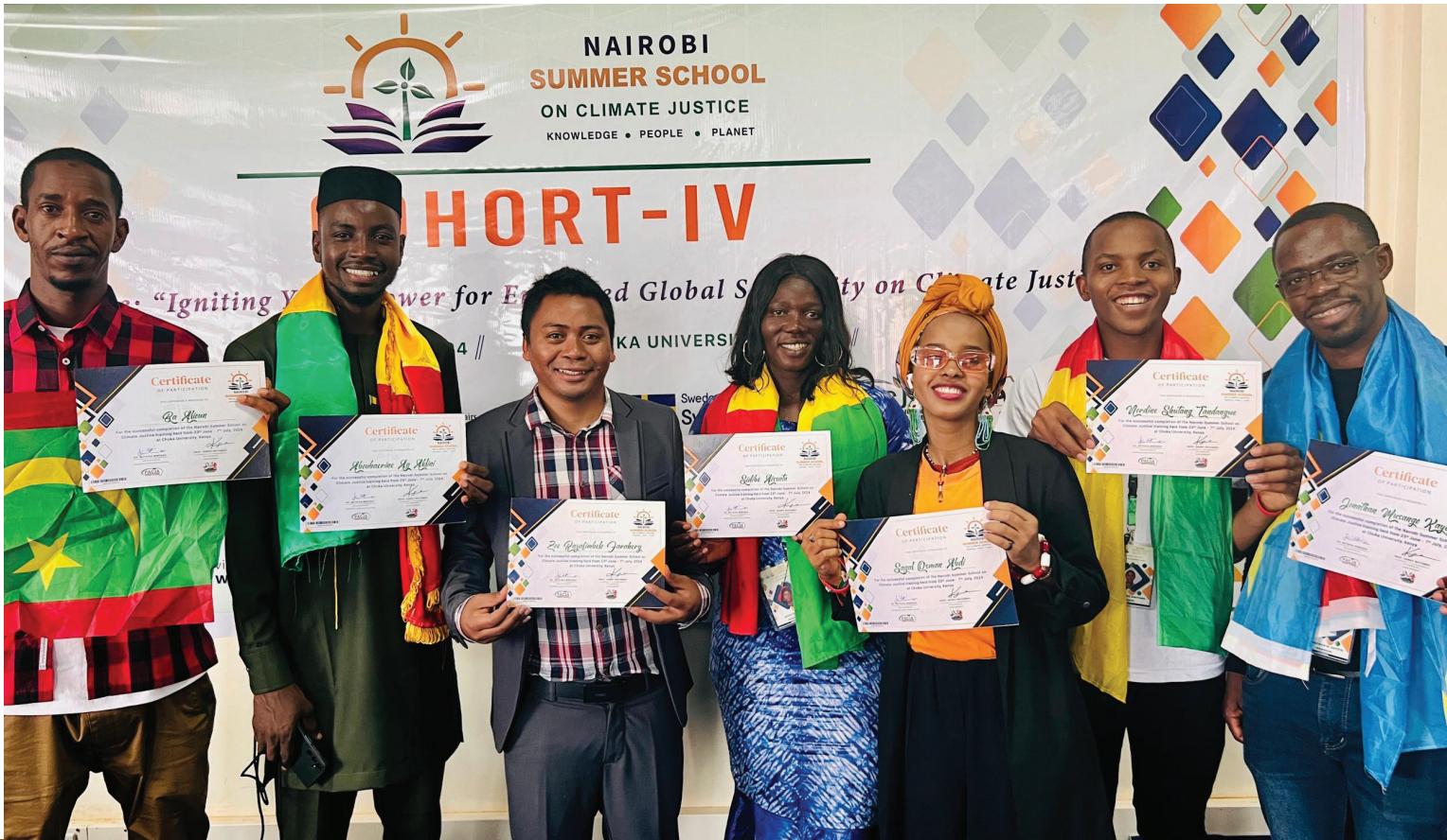
NSSCJ-IV Graduands at Chuka University, Tharaka Nithi, Kenya