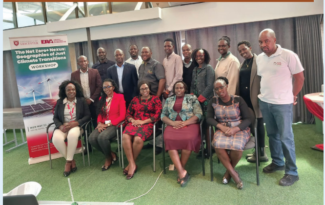
The Net Zero+ Nexus: Geographies of Just Climate Transitions Workshop